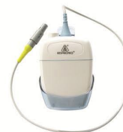
EtCO 2 Module (Sidestream)