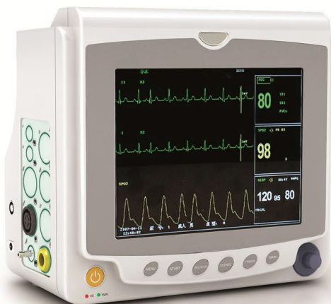
Accuit Sign 6