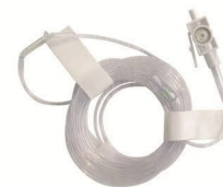
EtCO 2 Sampling tube